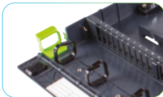
LATERAL PATCHING MANAGEMENT RINGS