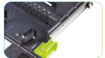
19" TELESCOPIC RAILS