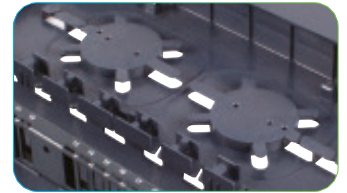
INTEGRATED ROUTING MANAGEMENT